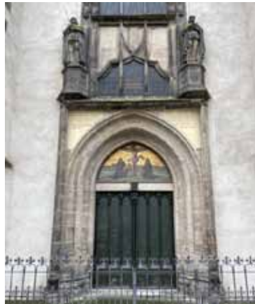
The Church door at Wittenberg

The terrible impact of dehumanisation, violence and war. Reminders of the subtle, hidden, or sometimes not so hidden checkpoints, walls, watchtowers, divisions that exist in our churches and communities. We found fragments of hope and inspiration at the 'Reconciliation Chapel' built from the rubble of a church which when the wall was erected in 1961 stood within the death strip, inaccessible to the people of both East and the West and finally blown up by order of the GDR government in 1985, four years before the wall fell. I reflected that there is where our churches should be, places of refuge from 'sniper fire', confronting the powers that try and divide us and set us against each other. It is written 'Christ is our peace, he has broken down the wall of hostility that divides us' (Ephesians 2), but what am I or should I be doing in the real world that makes a difference? Tomorrow, we travel to Wittenberg. If like Martin Luther, you could nail 95 theses to a church door to change the world – what would they be?